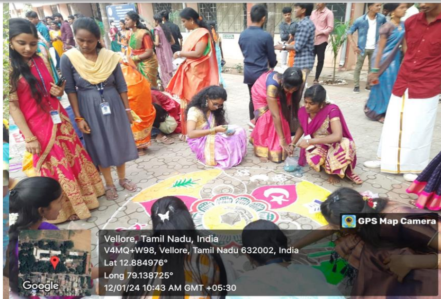
Photograph of Kolam competition during “Equality Pongal festival”. All faculty members and the students of all departments were participated on 12-01-2024.