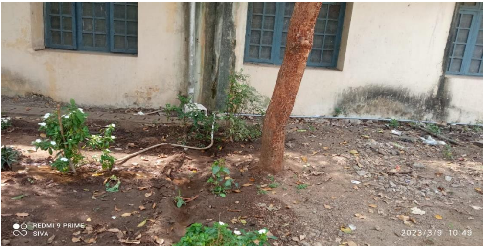
DISPOSAL OF RO WASTE WATER TO COLLEGE GARDEN