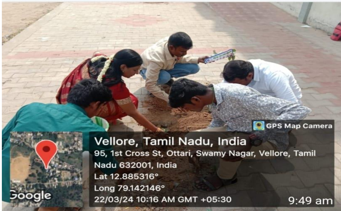
Plantation of trees inside the college campus.