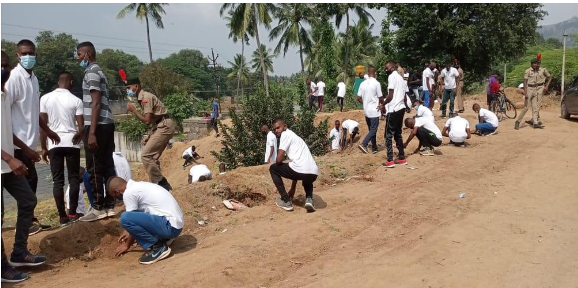
Photograph shows the Planting Palm tree in Otteri Lake