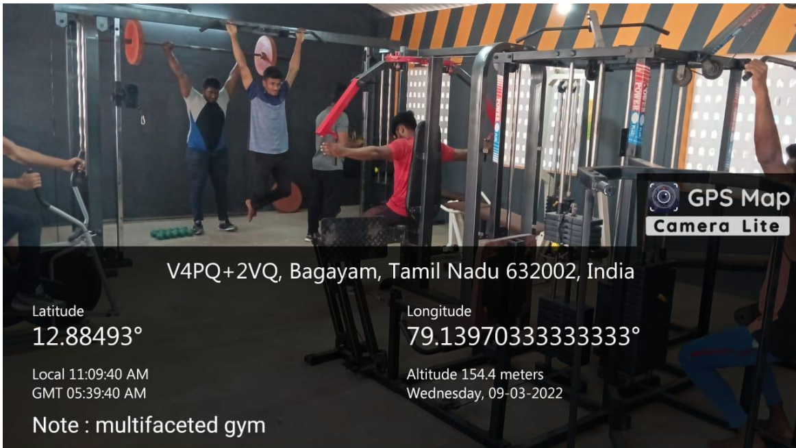
Photographs show the renovated gymnasium