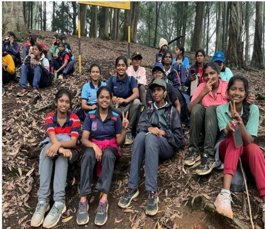
NCC training program conducted outside of the college campus.