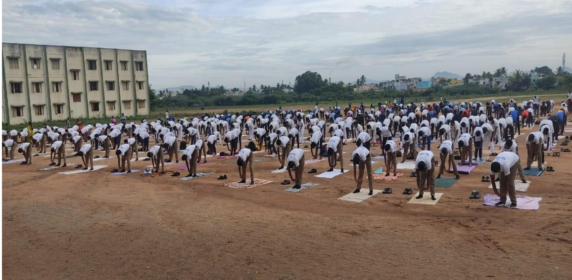
Photographs of Yoga performed by the students at College Playground.