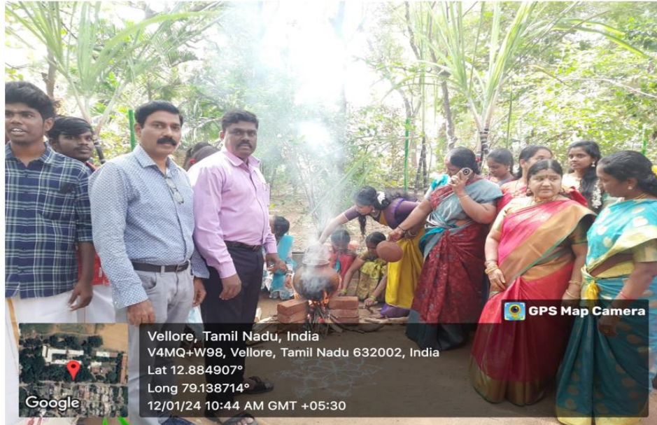
Geotagged photograph of the faculty members and the students of various departments were celebrated the “Equality Pongal festival” on 12-01-2024