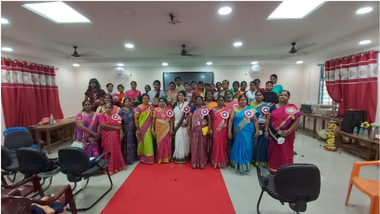
Photograph of committee members of Women's cell with Principal and Chief Guest

Phone: 0416-2262068, Fax: 0416 – 2262068, E-mail: mgacvlr@yahoo.co.in