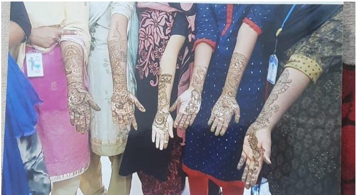
Photograph of Mehendi event in the Women's Day Celebration