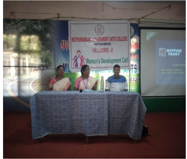
Photographs show the Nippon Paint Manager sitting in front of the Principal desk (Left) and inaugural function in the college auditorium (Right).