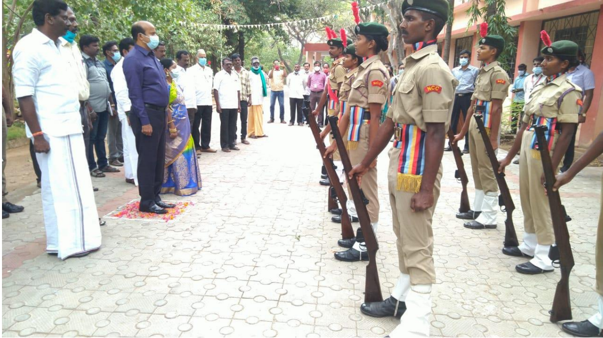
Guard of Honour to District Collector of Vellore

Phone: 0416-2262068, Fax: 0416 – 2262068, E-mail: mgacvlr@yahoo.co.in