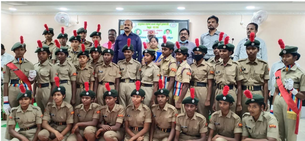
Women's NCC Unit with District Collector of Vellore