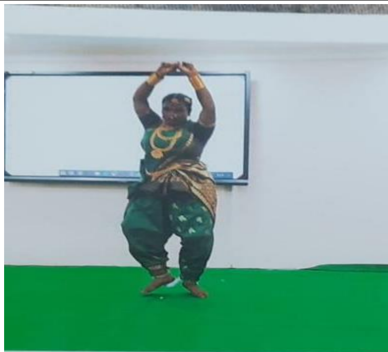
Dance programme in the Women's Day Celebration