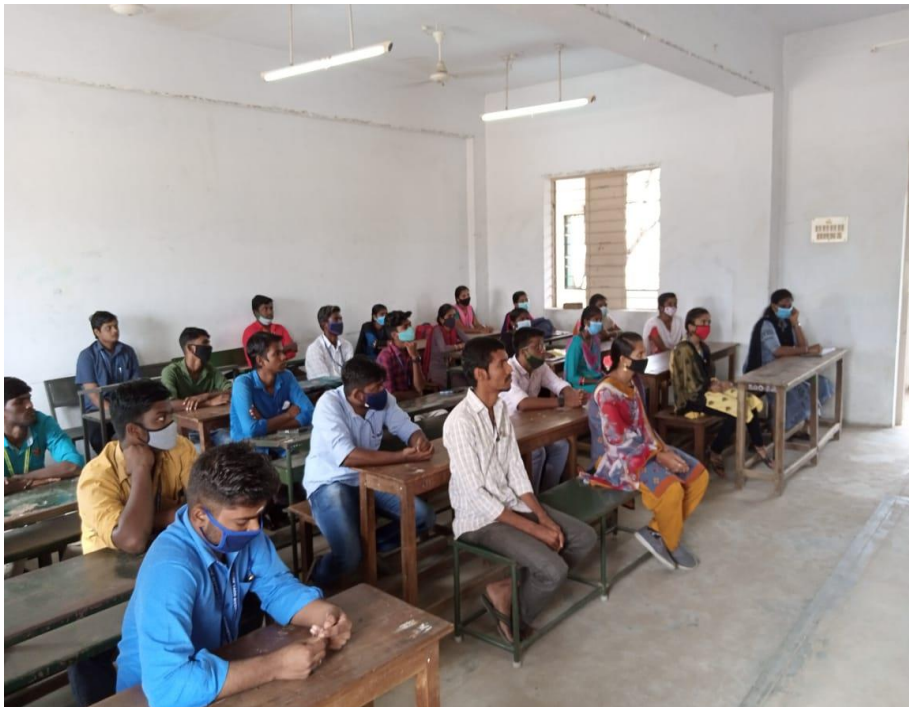
Speech competition held on 10-03-2022 at Economics department at 11.30 am which was announced by the Govt. of Tamil Nadu.