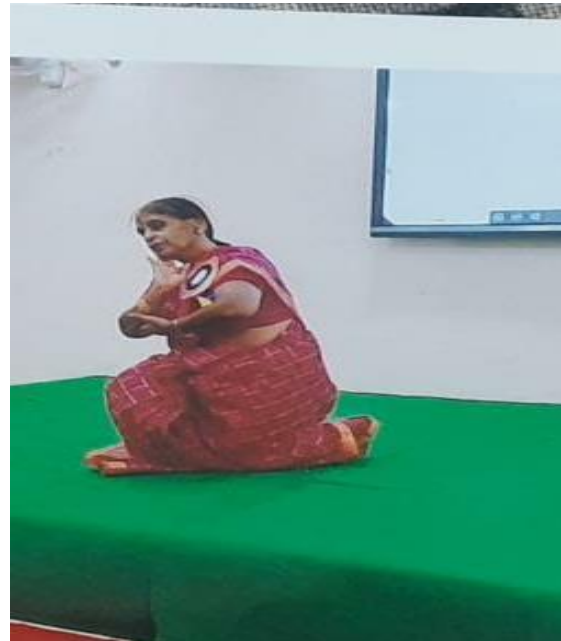
Dance programme in the Women's Day Celebration (Right hand side photo – Chief Guest Dance)