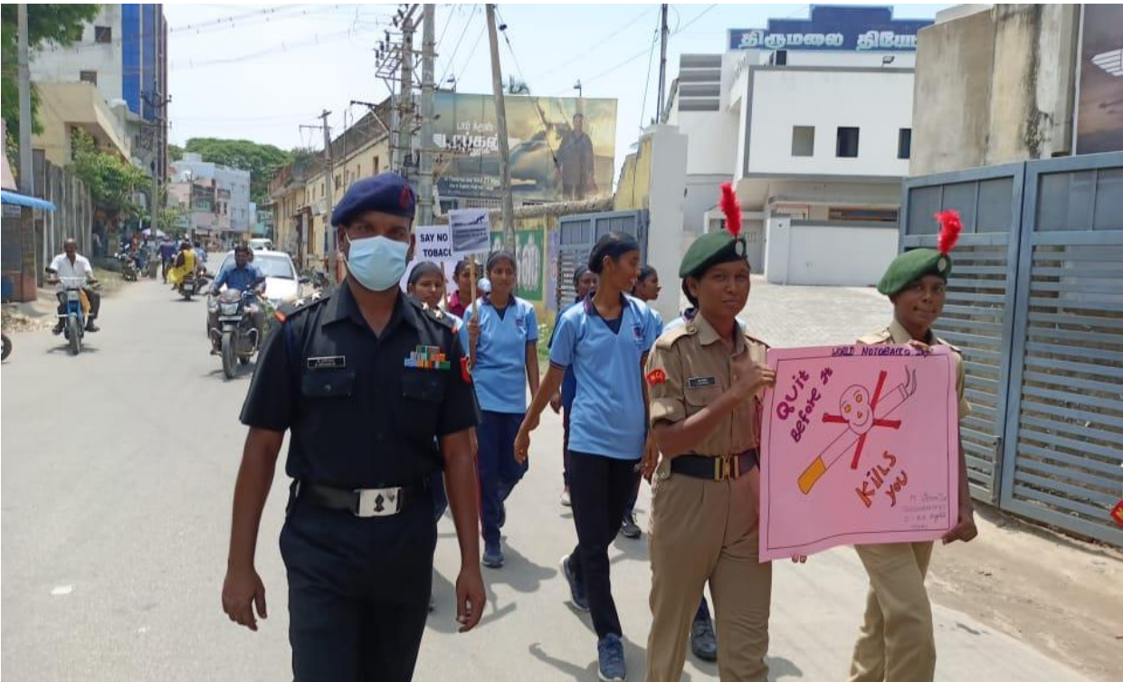
The Anti Tobacco rally initiated by NCC girls unit on the College Road, Otteri, Vellore-2.

Phone: 0416-2262068, Fax: 0416 – 2262068, E-mail: mgacvlr@yahoo.co.in