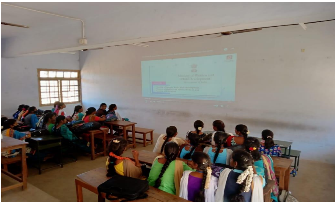
Photograph shows the “Ministry of Women’s and Child development – Online Video Conference Awareness Programme” – Dated: 11/03/2021”