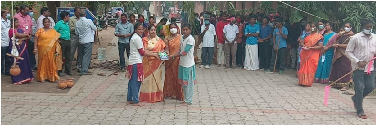
Photographs show the during Pongal Festival