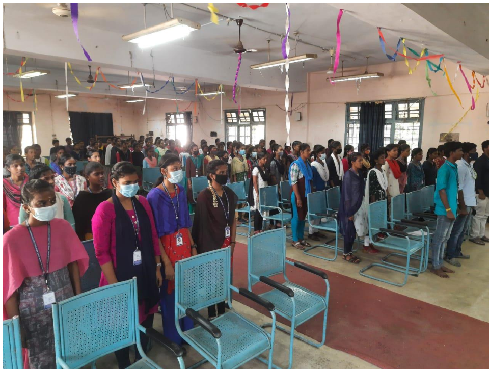
During invocation of Sexual Assault Awareness Seminar on 27 th May 2022 at 3.00 pm in College Auditorium