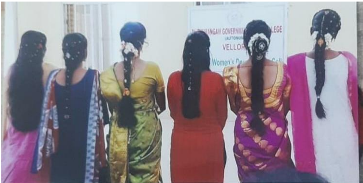
Photograph shows the Different Hair Grooming