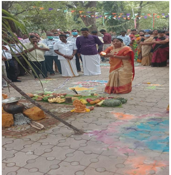
Photographs show the Pooja Celebrated on Pongal Festival