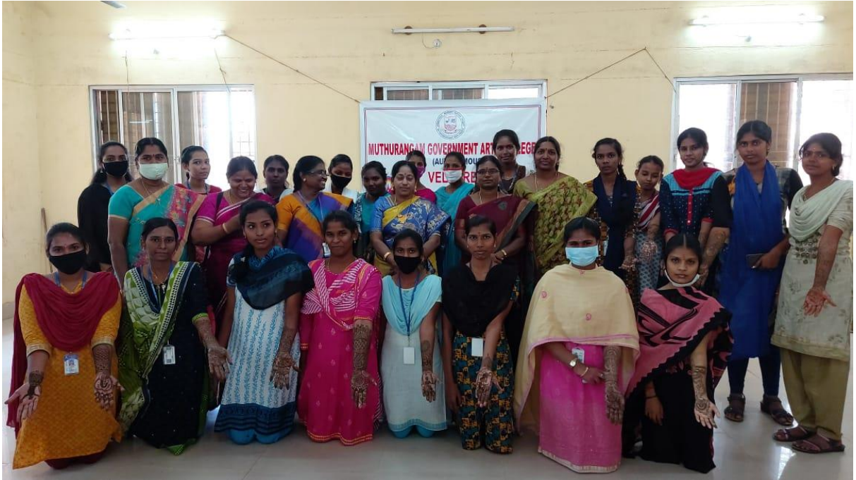
Photograph of Mehendi event in the Women's Day Celebration

Phone: 0416-2262068, Fax: 0416 – 2262068, E-mail: mgacvlr@yahoo.co.in