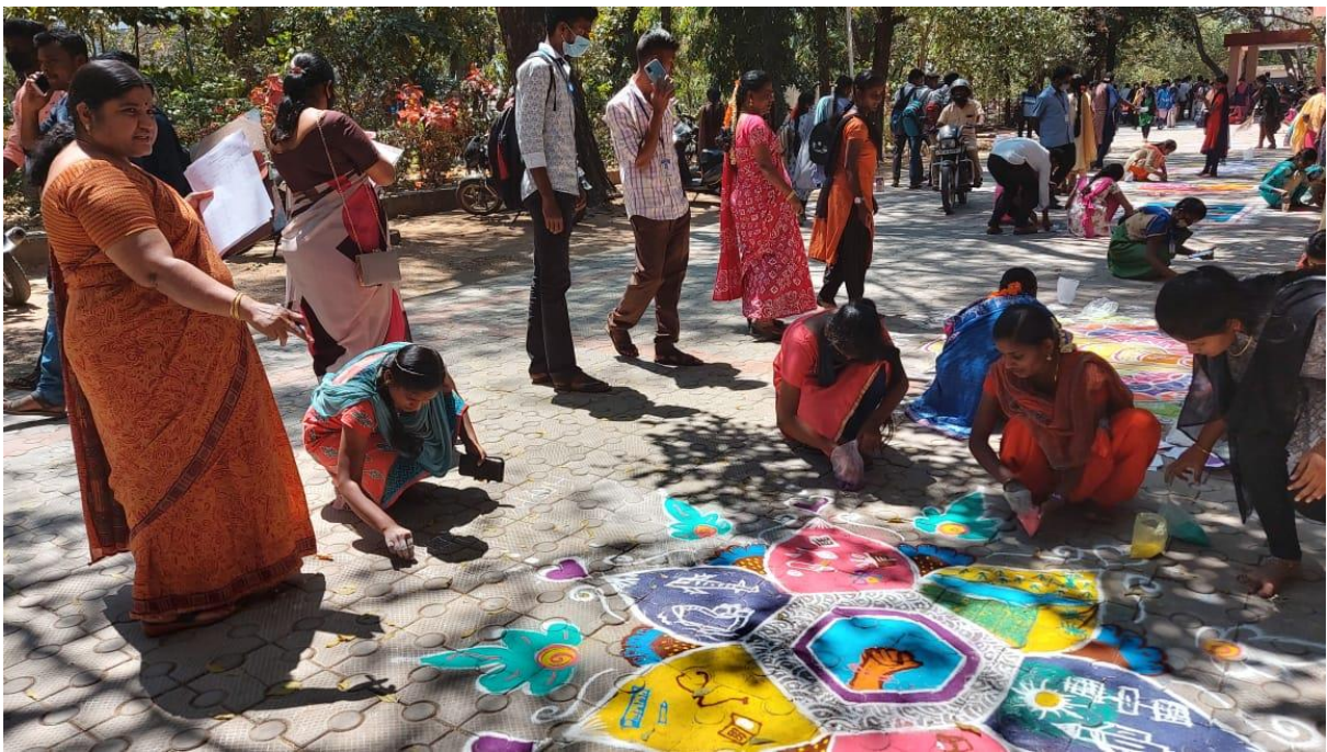
Photograph shows students participating in Rangoli