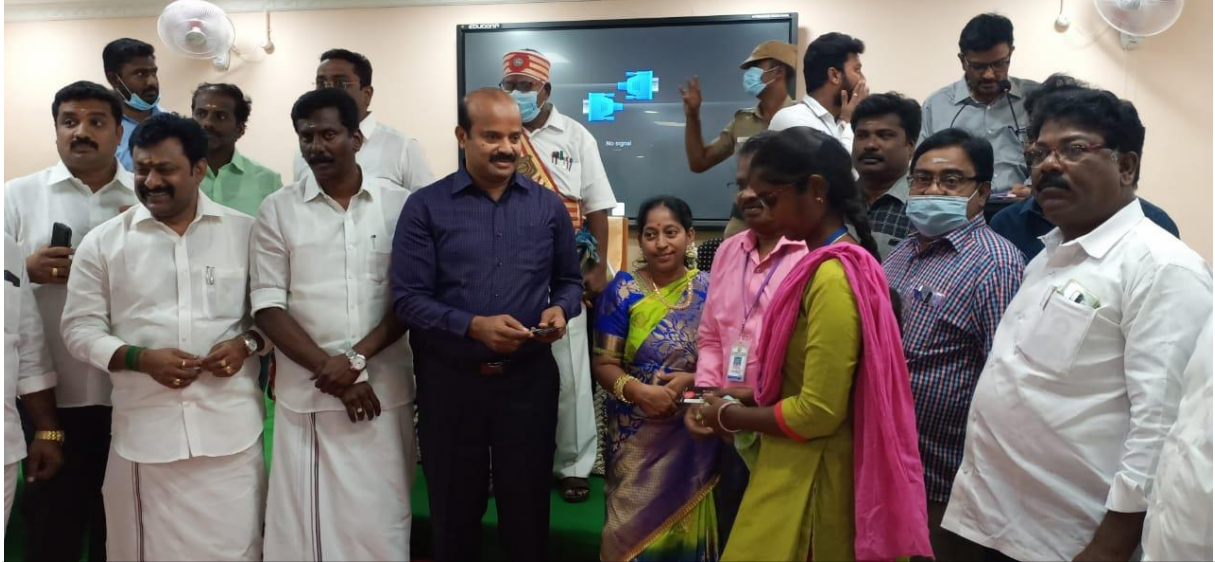
Vellore District Collector issuing SIM CARD to the Students

Phone: 0416-2262068, Fax: 0416 – 2262068, E-mail: mgacvlr@yahoo.co.in