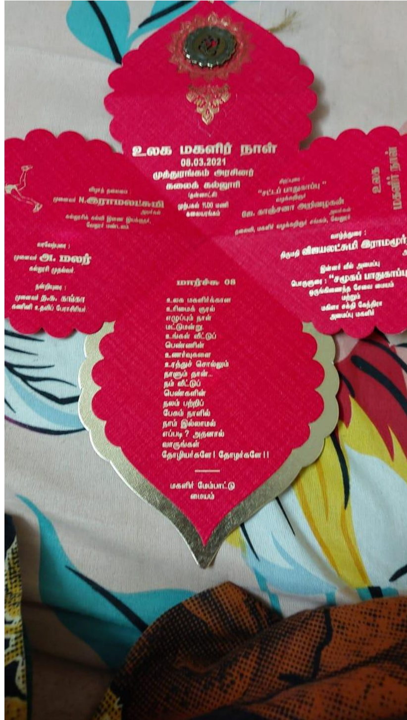
World Women's Day Invitation in TAMIL on 08 th Mar 2021

Phone: 0416-2262068, Fax: 0416 – 2262068, E-mail: mgacvlr@yahoo.co.in