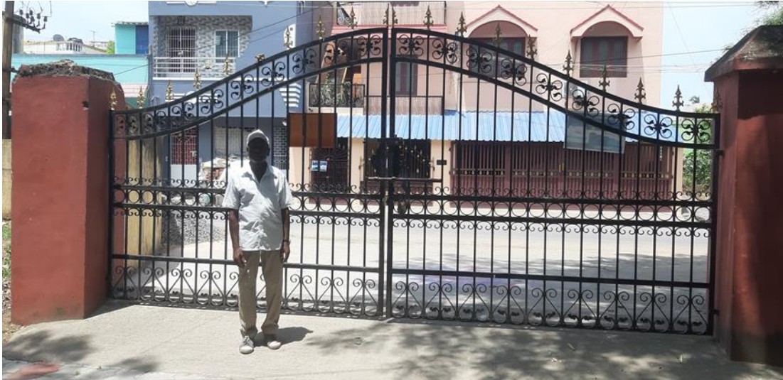
Photo View of Gate 2 with Security

Phone: 0416-2262068, Fax: 0416 – 2262068, E-mail: mgacvlr@yahoo.co.in