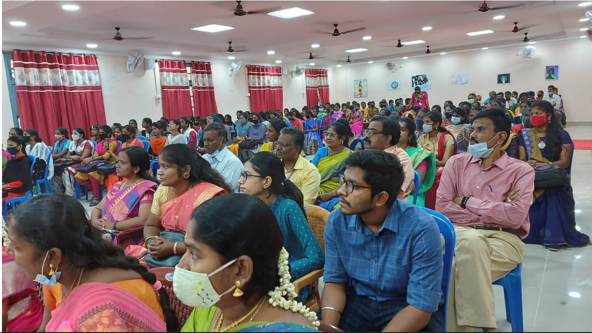
Photograph shows the Participants of World Women's Day Celebration

Phone: 0416-2262068, Fax: 0416 – 2262068, E-mail: mgacvlr@yahoo.co.in