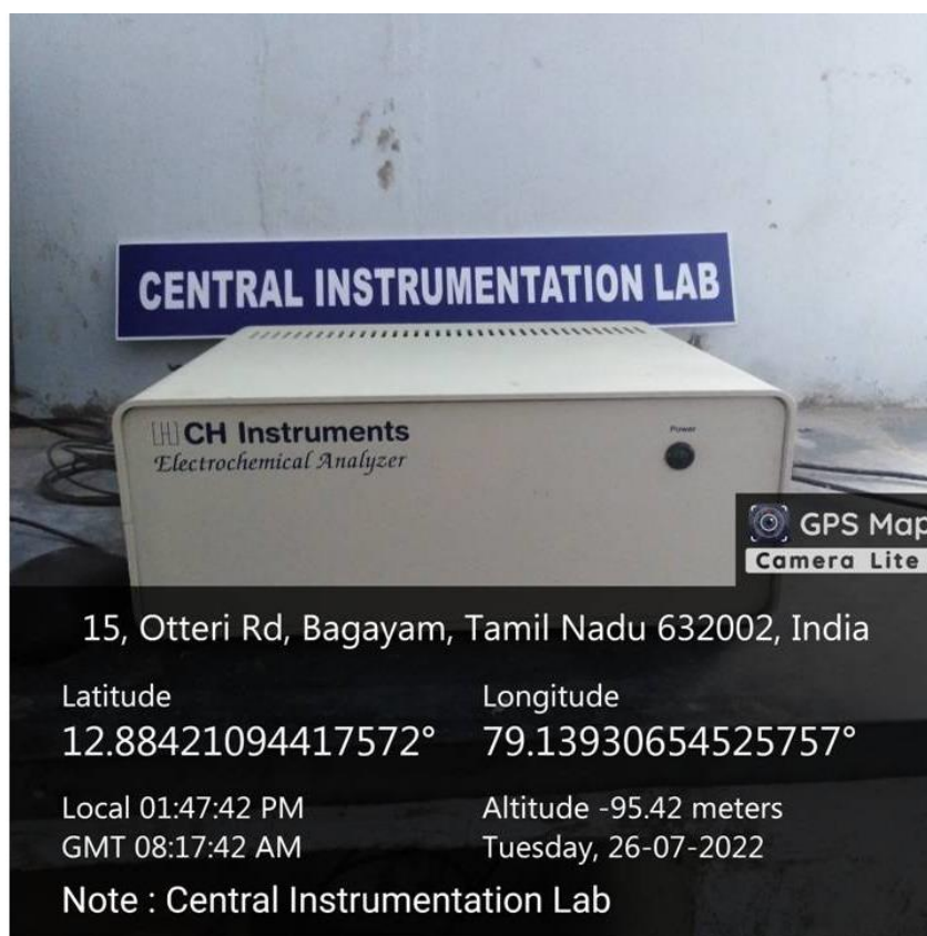
CHI electrochemical workstation