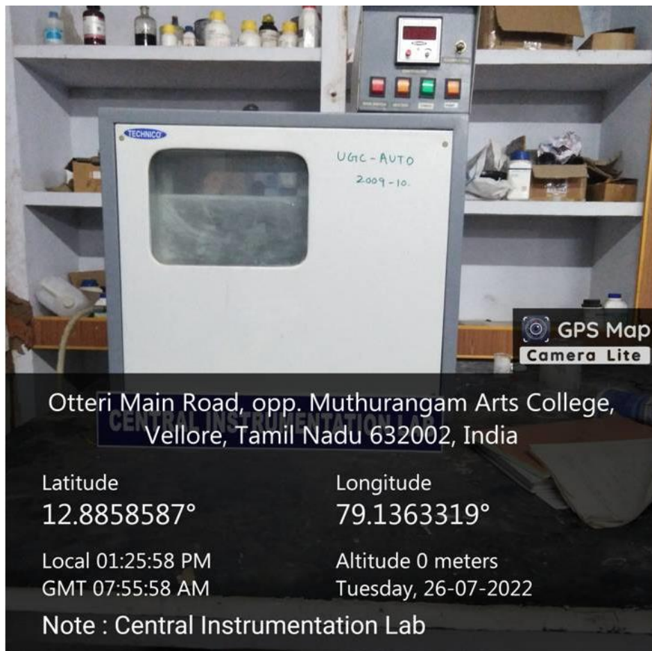
Constant temperature bath