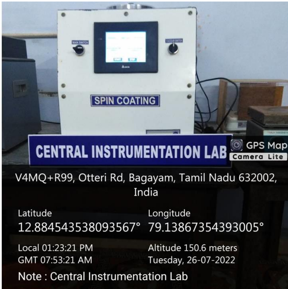
Spin coating unit