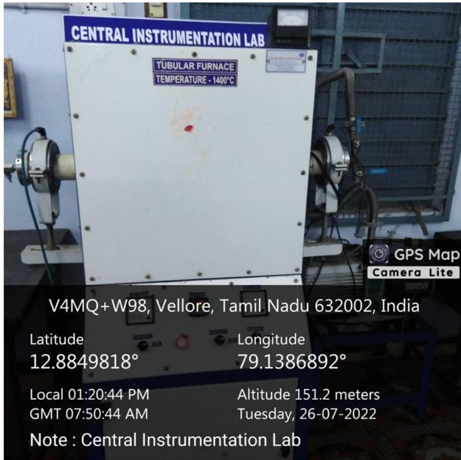
Tubular furnace (1600°C) with two mass flow controller