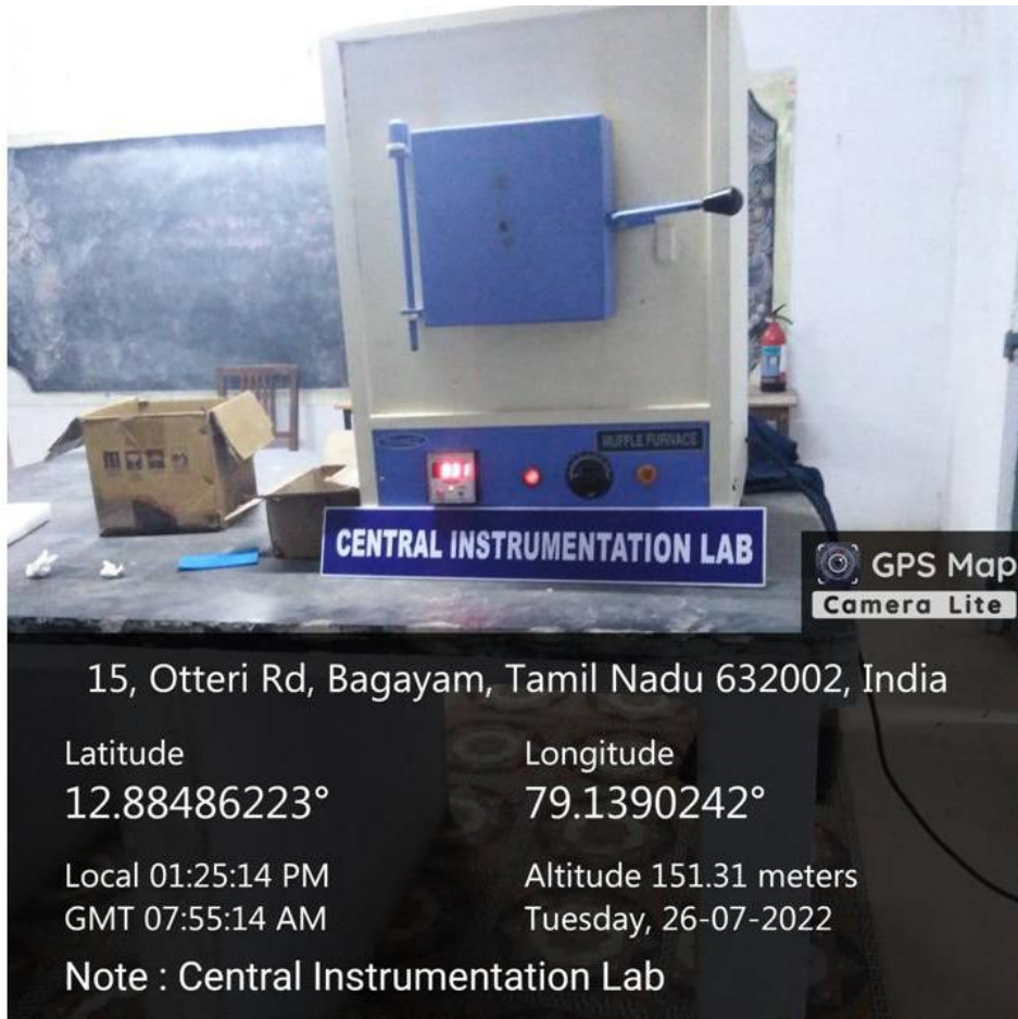
Muffler furnace (1000°C)